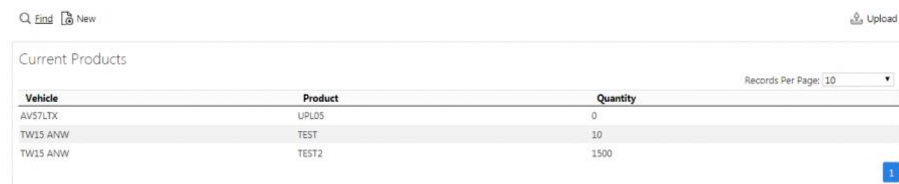
Vehicle Products Search Panel and Results table

Once you have entered the criteria, click Search . The screen will display a table of all the matching data. Any plain text boxes will match data that contains what you enter as the criterion.