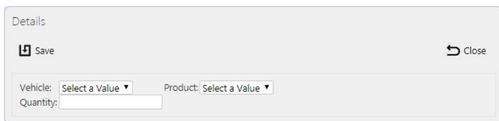
New Vehicle Product Pop-up

You can create new vehicle products by pressing the provided New button at the top of the screen.