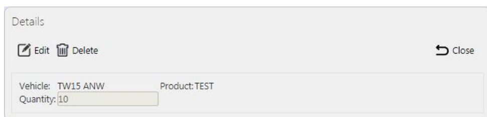
View/Edit Vehicle Product Pop-up

You can view and edit vehicle products by clicking the Select button against the line in the table. The screen will display a pop-up showing all the details of the vehicle product.