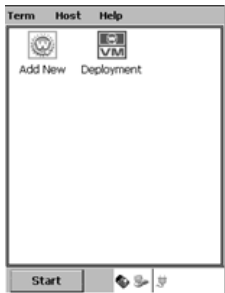
Figure 1. The Main Screen